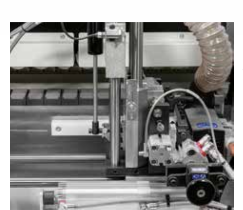
Round 1-V unit Rounding of straight or shaped corners of up to 60mm thick panels; separate machining of front and rear corners. Possibility of machining separate front and rear corners. Motor changeover for processing the second radius.