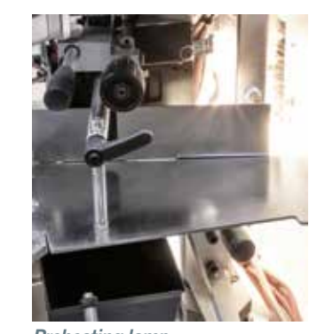
Preheating lamp For excellent edgebanding even at low room temperature.