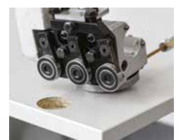
Nesting kit To process panels coming from nesting cycle.