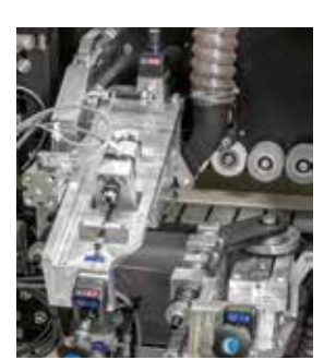
RAS-R edge scraping unit Simple and quick changeover between 2 radii.