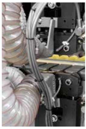
RC-N glue scraping unit It eliminates any glue excessing in the joint between edge and panel. Nesting processing.