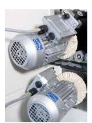
SP-M brushes Unit with 2 independent motors for edge cleaning and polishing.