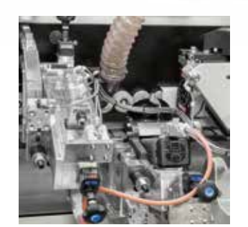
SR-V Trimming-Chamfering unit Machining of two radii, thin edge and solid wood lipping with automatic unit setup.