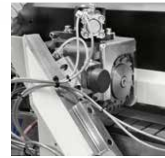
K-2 Radius end cutting unit Cut and radius in a single operation.